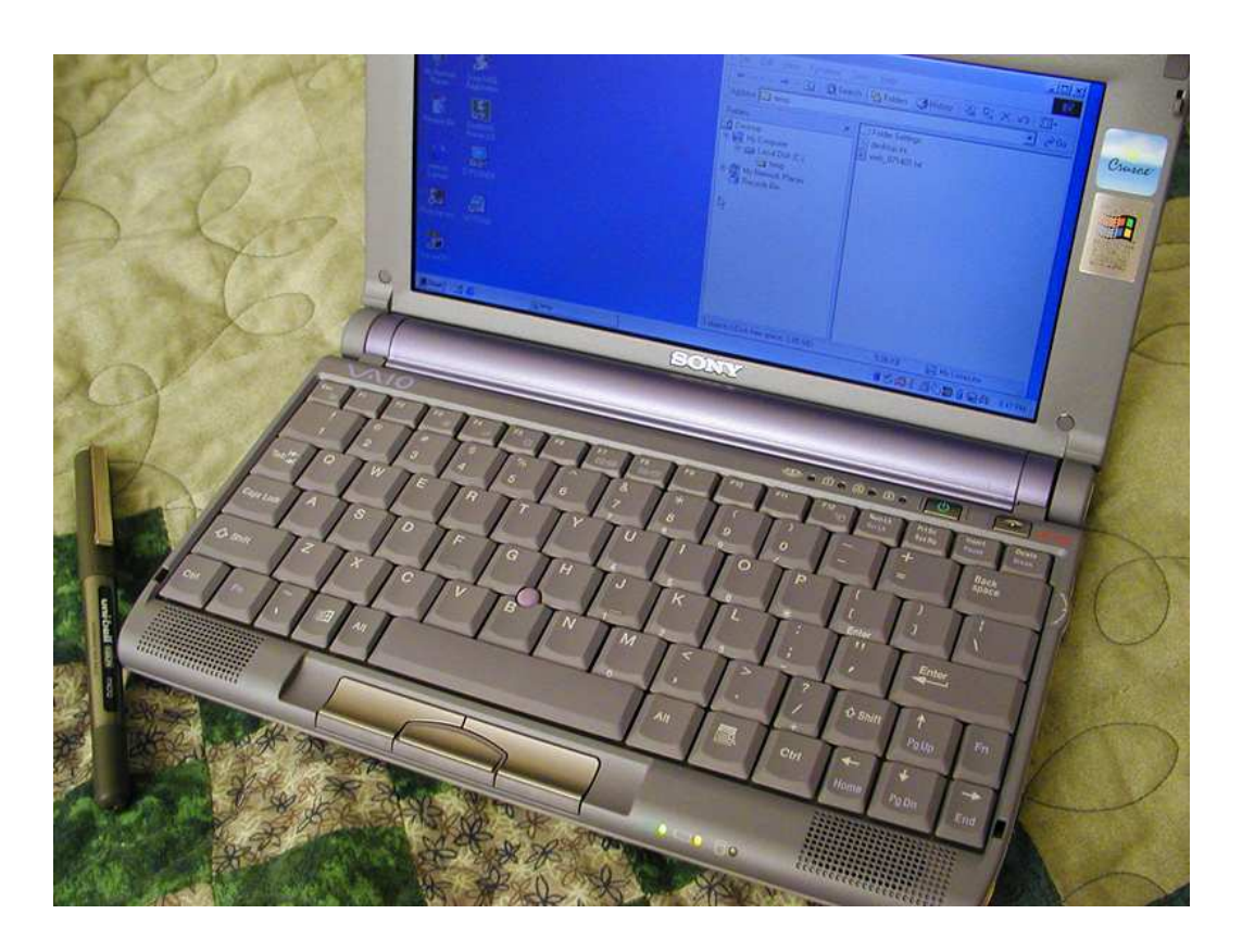
With the right autoresponder program, you can live an easy life on the go.

Happy marketing and may every success will be yours.